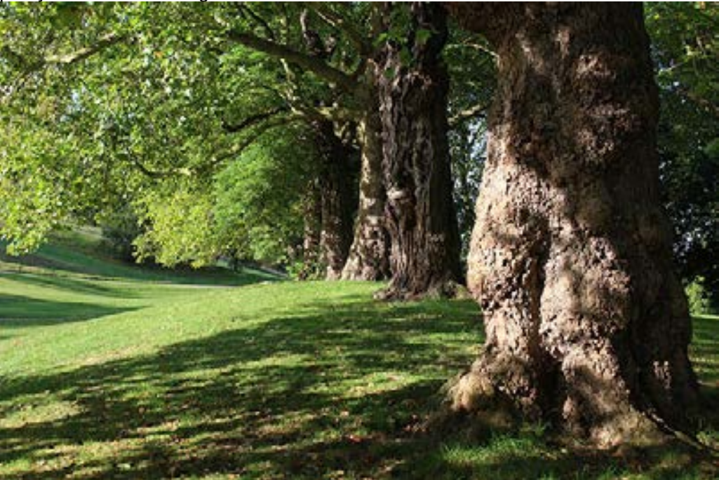
Fig 4 Landscapes are for yesterday, today and tomorrow

policy statements could galvanize the Institute.