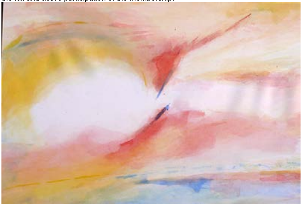
Fig 2 Of all the design professions, landscape architecture has the greatest potential to give society pleasure. The fulfilment and colourful enjoyment of this potential should be at the core of the Institute's ethos. But this is not the present situation (watercolour by Edward Hutchison)

Landscape architecture is one of the world's most important professions. Yet it needs the support of an active and vocal professional body. The old ILA stepped up to this challenge. We had high hopes for the re-formed Landscape Institute when it was launched in 1975. Members of the public find the term 'landscape architecture' non-intuitive. So the focus on 'our most important word', landscape, might have helped - and might yet. But we need to publicise the many ways in which the landscape profession can help create more sustainable landscapes, more functional landscapes and more beautiful landscapes. Members of the profession can work together to achieve these goals. We are lucky that so many people have worked to create a professional organisation dedicated to our interests. We believe the Landscape Institute needs to re-formed, re-focussed and re-energised. This is most likely to happen with the full and active participation of the membership.